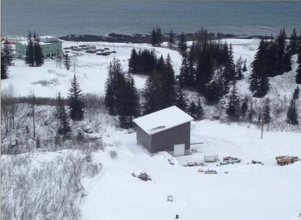
The newly constructed Allison Creek Power Plant in early spring